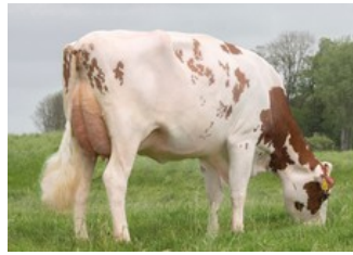
Lakeside Ups Red Range VG-86