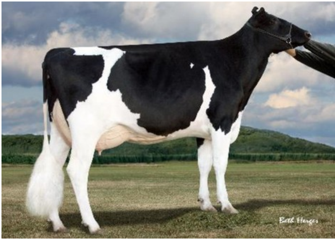
KHW Goldwyn Aiko RC EX-91