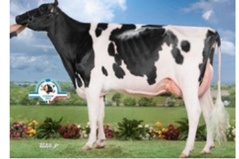
Hermine Tual, family of Maybelline

Holysmokes x GP-84 AltaZazzle x Kenobi x Granite x VG-85 Rubicon x GP-84 Cashcoin x VG-86 Man-O-Man x VG-86 Shottle x GP-84 Finley x Brett