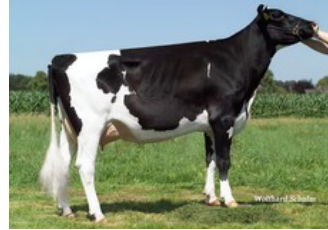
KNS Riviera VG-86