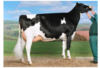
KNS Rendezvous VG-85