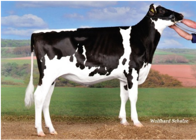
KNS Real Madrid