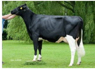
De Biesheuvel Javina 50 VG-87