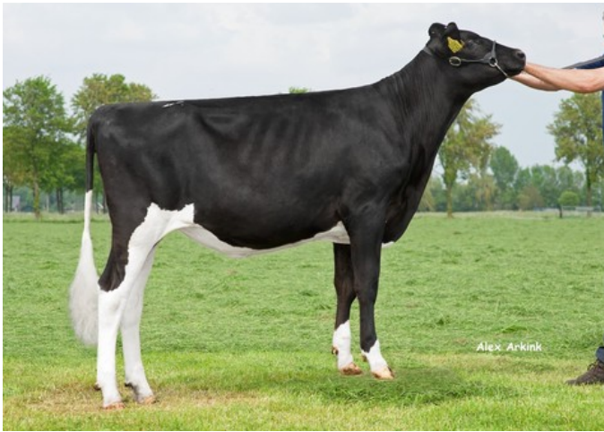
Willem's Hoeve Javina 1242