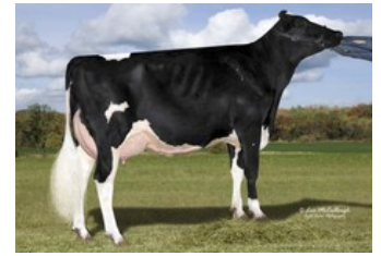
Cookiecutter MOM Halo VG-88