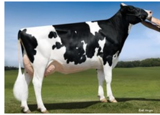
Cookiecutter Ssire Have VG-86