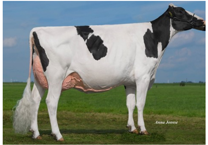
Holec Mogul Panzul VG-88

Parsly x VG-87 Tirsvad Natan x GP-83 Magictouch x EX-90 Kingboy x VG-88 Mogul x VG-87 Man-O-Man x VG-87 Goldwyn x EX-91 Outside x EX-91 Rudolph x EX-92 Inspiration