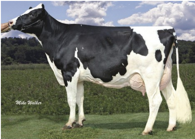
Coyne-Farms Ramos Jelly VG-85