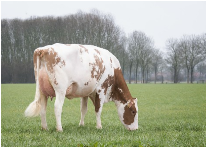
Koepon OH Rubels Range 17 Red VG-86