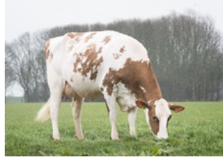
Koepon OH Rubels Range 17 Red VG-