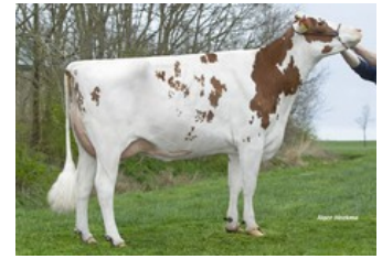
Lakeside Ups Red Range VG-86