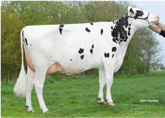
Koepon Date Range 10 RDC GP-84