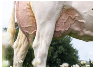
Visstein K&L SV Aderina Red VG-89