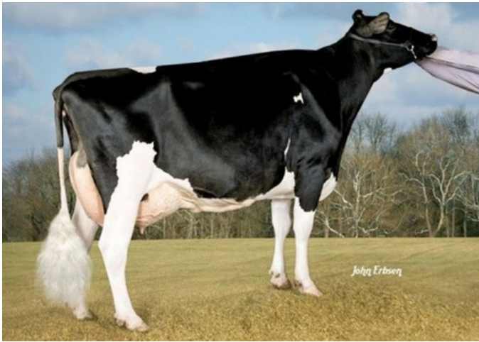
Kamps-Hollow Durham Altitude EX-95