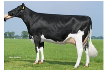
Willsbro K&L Nugget Aderyn RDC VG-87