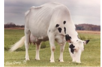
D-R-A August EX-96

Ridercup x VG-86 Rubels-Red x VG-89 Salvatore Rc x VG-87 Nugget RDC x VG-85 Supersire x EX-90 Superstition x EX-91 Goldwyn x EX-95 Durham x EX-93 Prelude x EX-94 Jubilant RF