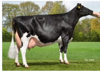
Willsbro K&L Nugget Aderyn RDC VG-