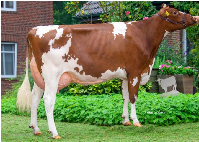
K&L SP Ariana Red VG-88