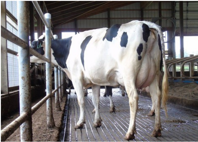
OCD Supersire 9882 VG-86