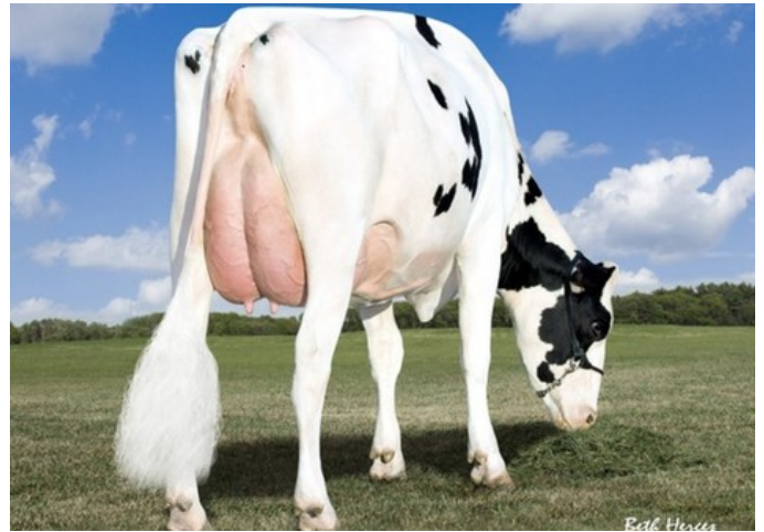
Ammon-Peachey Shana VG-87

Fugleman x GP-82 Solution x VG-85 Achiever x VG-86 AltaSpring x VG-86 Supersire x EX-90 Robust x VG-87 Planet x VG-86 Shottle x VG-86 O Man x EX-92 Rudolph