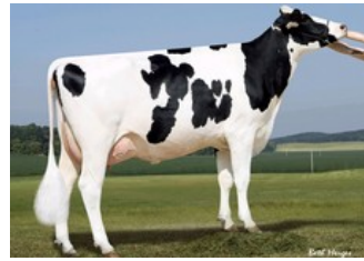
Sandy-Valley IO Amethyst VG-87