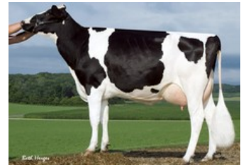
Sandy-Valley Plane Sapphire VG-87