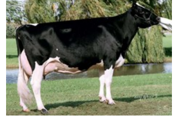
Snow-N Denises Dellia EX-95

Camus x Bali x VG-86 Gymnast x VG-86 Supershot x VG-85 McCutchen x VG-87 Altalota x VG-87 Planet x EX-92 Bolton x VG-87 Forbidden x VG-89 BW Marshall