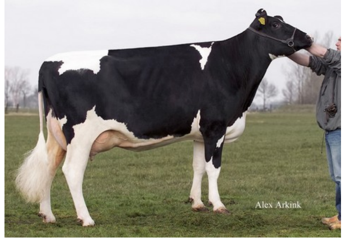
Sunday ALH Prudence VG-88

Cartoon P Red x VG-86 Rubels-Red x VG-86 Salvatore Rc x VG-89 Rubicon x GP-83 Aikman RDC x VG-85 Man-O-Man x VG-87 Mascol x VG-88 Durham x EX-90 Rudolph x EX-95 Chief Mark