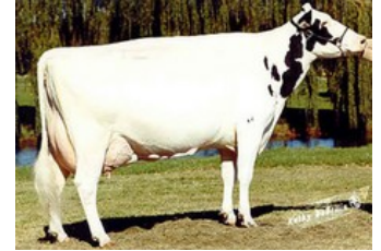
D-R-A August EX-96

HugoPP RDC x VG-86 Solitair P Red x Alaska Red x VG-85 Salsa RC x VG-87 Supersire x VG-85 Alexander x EX-91 Goldwyn x EX-95 Durham x EX-93 Prelude x EX-94 Jubilant RF