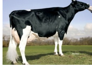
Kamps-Hollow Durham Altitude EX-95