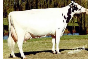
D-R-A August EX-96

HugoPP RDC x VG-86 Solitair P Red x Alaska Red x VG-85 Salsa RC x VG-87 Supersire x VG-85 Alexander x EX-91 Goldwyn x EX-95 Durham x EX-93 Prelude x EX-94 Jubilant RF