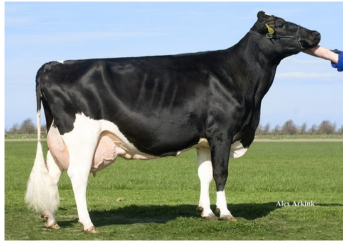
Newhouse Sneeker 247 VG-89

Endless RDC x VG-85 Floris x VG-86 Esperanto x VG-86 Checkers x VG-85 Balisto x VG-87 Stol Joc x VG-89 O Man x VG-89 Addison x VG-85 Jimtown x VG-85 Sunny Boy