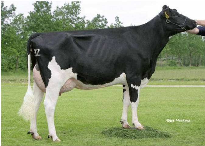
Newhouse Sneeker 422 VG-87