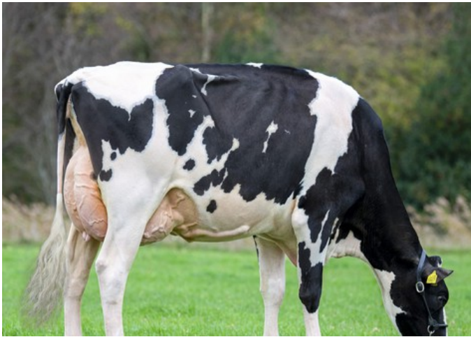
Drouner K&L Aiko 1557 RDC VG-89