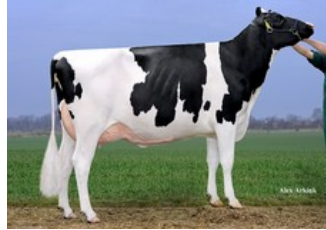
Drouner AJDH Aiko RDC VG-87