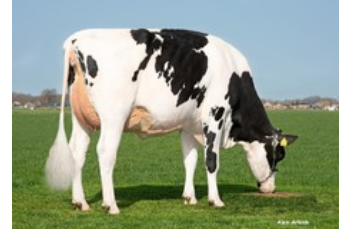
JK Eder Medley Evalyn 1 EX-90

Chandler x EX-90 Medley x EX-91 Jedi x VG-88 President x GP-84 Mogul x VG-86 Active x EX-90 Titanic x VG-85 Addison x VG-86 Manfred x EX-90 Duster