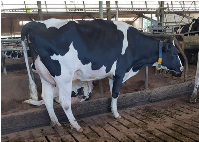
Holbra Malon 17 VG-87