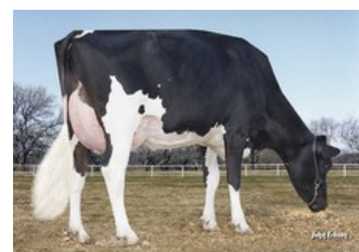
Morningview Pronto C-Rae EX-90