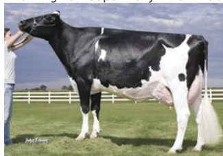
Early-Autumn Golden Rae EX-93