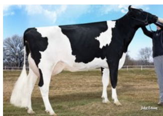
Morningview Super Roxy RDC EX-90