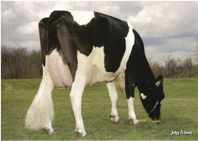
De-Su BW Marshal Georgia EX-90