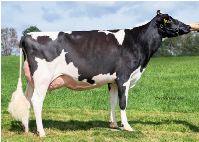
Welcome RUW Delicious VG-88