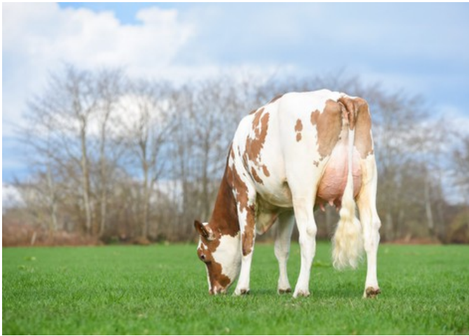
GIH Little Star VG-86