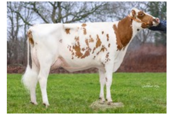
GIH Ronald Aura Red VG-86