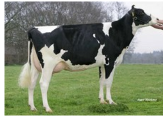
Holbra Manoa VG-85