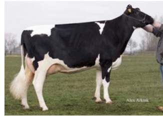
Sunday ALH Prudence VG-88