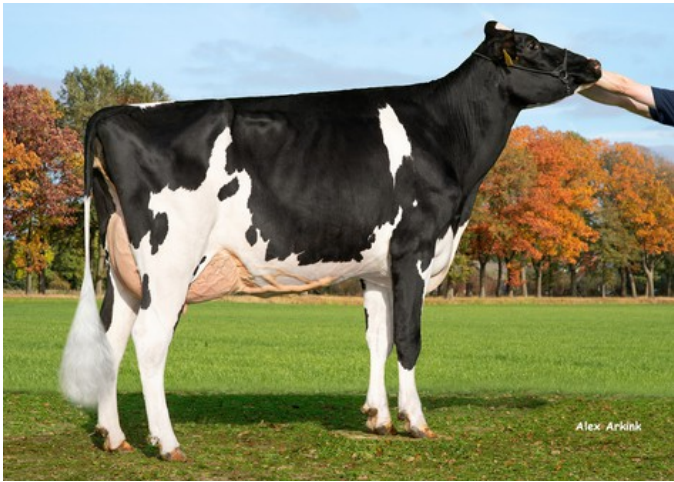
De Oosterhof DG Leida VG-85