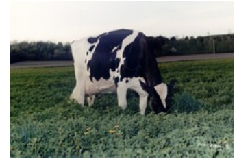
Golden-Oaks Mark Prudence EX-95

Perfect x VG-85 Charl x VG-85 Altatopshot x VG-89 Rubicon x GP-83 Aikman RDC x VG-85 Man-O-Man x VG-87 Mascol x VG-88 Durham x EX-90 Rudolph x EX-95 Chief Mark