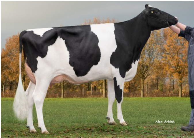
K&L OH Mabel