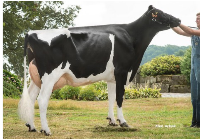
Maybelline Tual VG-85

Conway x GP-83 Einstein x Granite x VG-85 Rubicon x GP-84 Cashcoin x VG-86 Man-O-Man x VG-86 Shottle x GP-84 Finley x Brett x Lantz