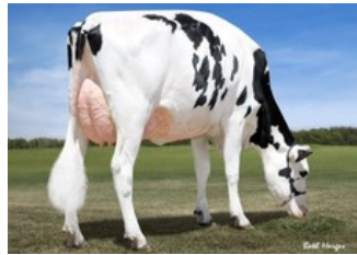
Dymentholm Sunview Sunday VG-87