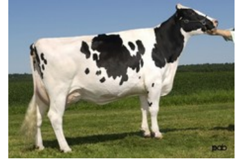
Glen Drummond Splendor VG-86

Cartoon P Red x Rubels-Red x GP-84 Salvatore Rc x Rubicon x GP-83 Cashcoin x VG-87 Snowman x EX-90 Planet x VG-85 Bolton x VG-87 Goldwyn x VG-87 Durham