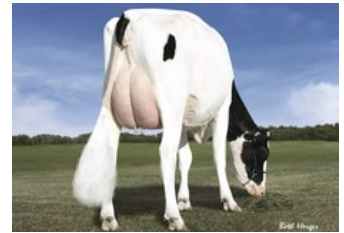
Des-Y-Gen Planet Silk EX-90