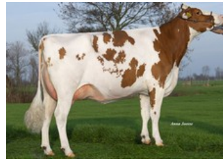
Batouwe Ailisha Salva Red VG-85