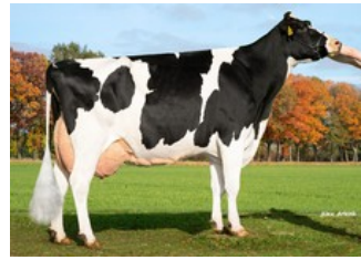
DG OH Donna RDC VG-89