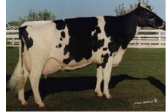
Golden-Oaks Mark Prudence EX-95

Altawheelhouse x VG-85 Charl x VG-85 Altatopshot x VG-89 Rubicon x GP-83 Aikman RDC x VG-85 Man-O-Man x VG-87 Mascol x VG-88 Durham x EX-90 Rudolph x EX-95 Chief Mark