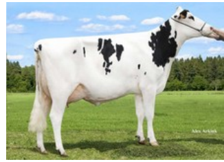
DKR Silence Secret RC VG-85