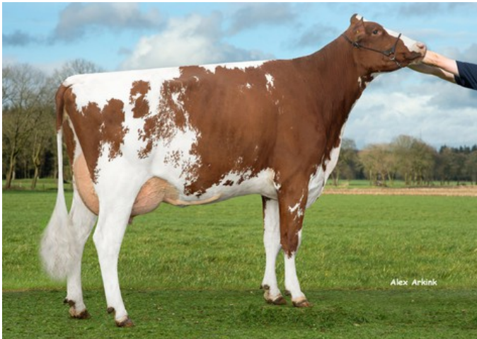
3STAR OH Sunnyside Red