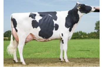
Wil Honig, Lineman sister to Hilma

VG-85 Altamagnifique x VG-85 Charl x GP-84 Pledge x VG-85 Saloon x VG-85 Snowman x VG-87 Goldwyn x EX-94 Outside x VG-88 Lee x VG-85 Starleader x VG-89 Raider