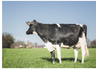
Wilder Hira VG-85