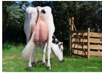
HC Archrival Arianne VG-89 EX-MS,