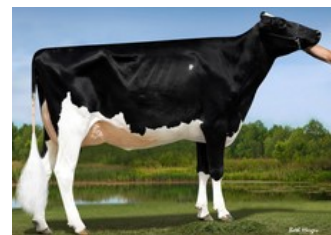
MS Ariannas Door Armani VG-85