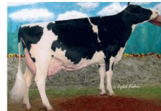
MS Kingstead Chief Adeen EX-94

VG-87 Doral-Red x VG-89 Warrior-Red x Jordy-Red x VG-89 Archrival x VG-85 Doorman x EX-94 Atwood x EX-94 Skychief x EX-94 Starbuck x Sheik