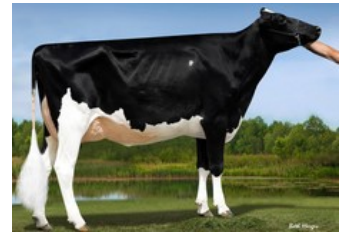
MS Ariannas Door Armani VG-85