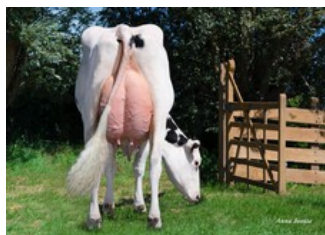
HC Archrival Arianne VG-89 EX-MS,