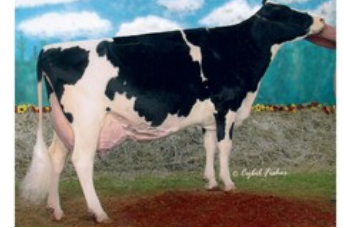
MS Kingstead Chief Adeen EX-94

Doral-Red x VG-89 Warrior-Red x Jordy-Red x VG-89 Archrival x VG-85 Doorman x EX-94 Atwood x EX-94 Skychief x EX-94 Starbuck x Sheik