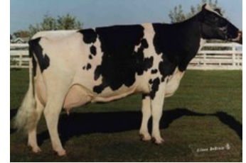
Golden-Oaks Mark Prudence EX-95

Gameday x GP-84 AltaAltuve RDC x VG-86 Salvatore Rc x VG-89 Rubicon x GP-83 Aikman RDC x VG-85 Man-O-Man x VG-87 Mascol x VG-88 Durham x EX-90 Rudolph x EX-95 Chief Mark