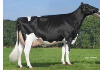
A-L-H Australia RDC VG-87