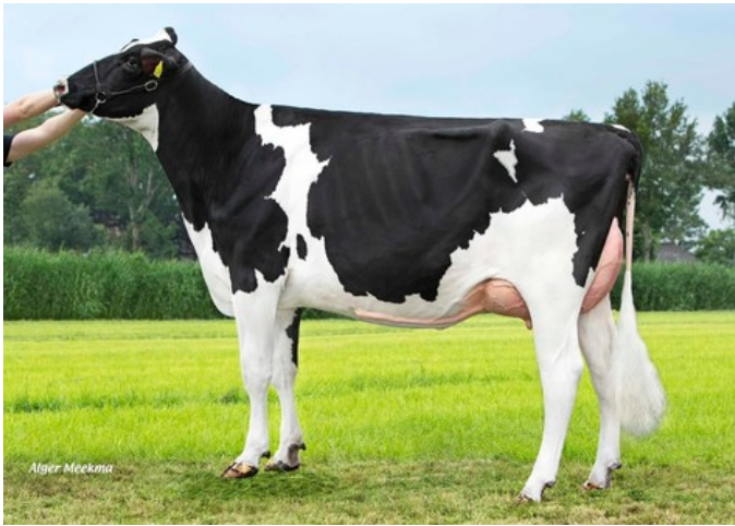
New Moore Tp Lizzy VG-85