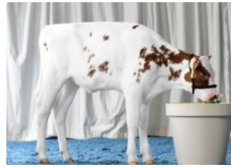
Amber PP Red VG-86