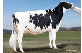
Gold-N-Oaks Arabell 1765 VG-88,

GP-82 Ranger-Red x GP-84 Riveting x EX-91 Superhero x Silver x GP-82 Supersire x VG-87 Bookem x VG-88 Man-O-Man x VG-89 Shottle x EX-94 Morty x VG-87 Marshall