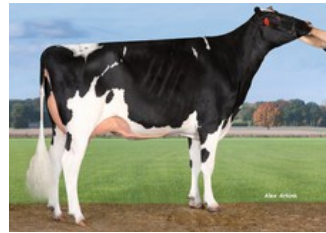
Pen-Col Superhero Mistral EX-91