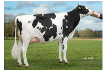
Tirsvad K&L Riveting Magnolia GP-84