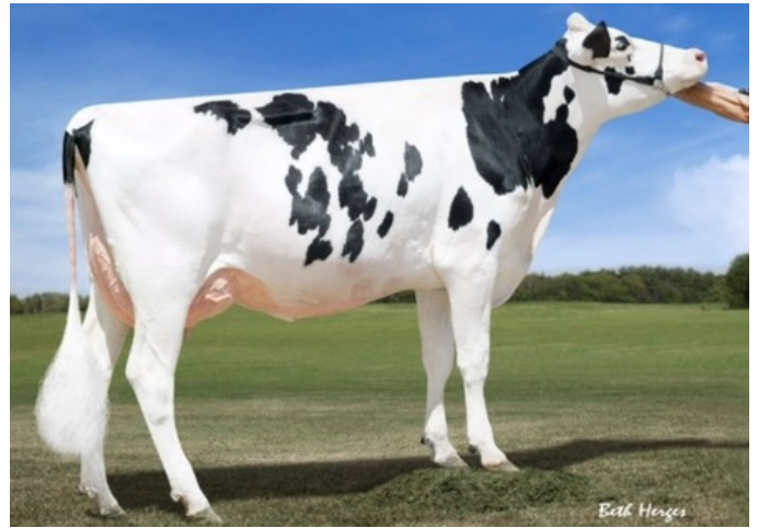
Dymentholm Sunview Sunday VG-87

Freestyle-Red x Rubels-Red x GP-84 Salvatore Rc x Rubicon x GP-83 Cashcoin x VG-87 Snowman x EX-90 Planet x VG-85 Bolton x VG-87 Goldwyn x VG-87 Durham