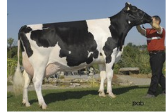
Gen-I-Beq Durham Sherry VG-87

VG-87 Freestyle-Red x VG-85 AltaDateline x GP-84 Salvatore Rc x Rubicon x GP-83 Cashcoin x VG-87 Snowman x EX-90 Planet x VG-85 Bolton x VG-87 Goldwyn x VG-87 Durham