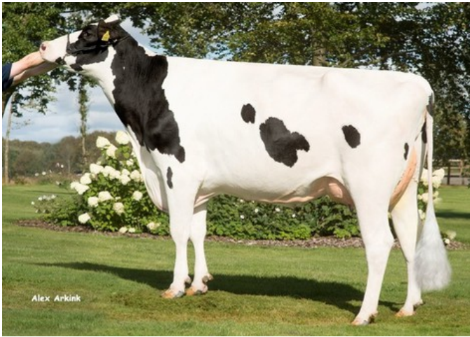
Tirs vad Silver Giga-Star VG-87