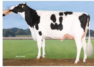
Tirs vad Sniper Gambia VG-89