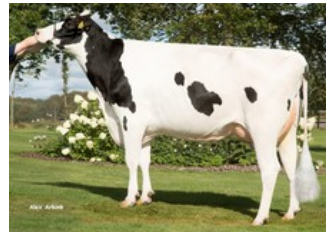
Tirs vad Silver Giga-Star VG-87