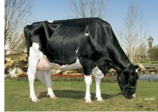
Kamps-Hollow Durham Altitude EX-95