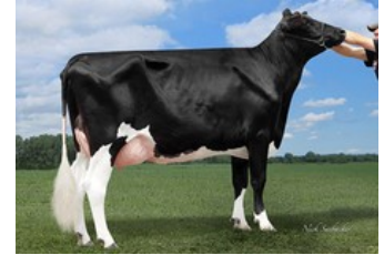
KHW Alxndr Ayako VG-85

Money P x VG-88 Solitair P Red x VG-88 Lucky PP-Red x VG-85 Salsa RC x VG-87 Supersire x VG-85 Alexander x EX-91 Goldwyn x EX-95 Durham x EX-93 Prelude x EX-94 Jubilant RF