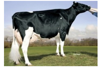
Kamps-Hollow Durham Altitude EX-95