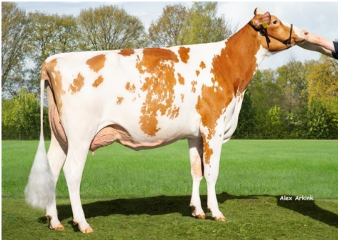
Sudena Alice Red VG-86