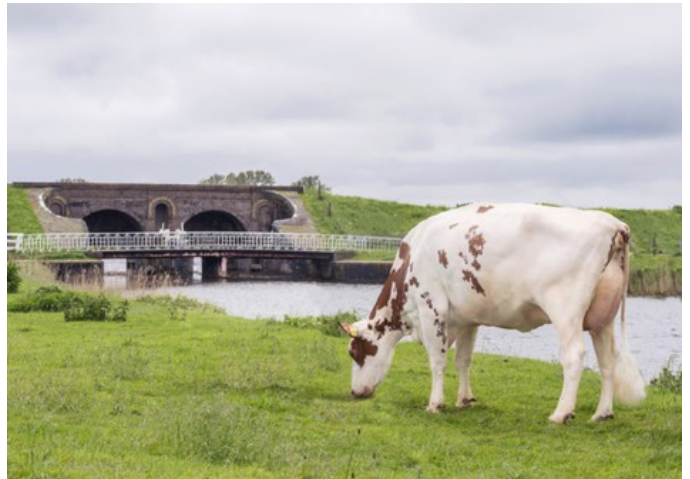
Lakeside Ups Red Range VG-86

GP-84 Crisalis RF x GP-84 AltaAltuve RDC x VG-86 Salvatore Rc x VG-89 Rubicon x GP-83 Aikman RDC x VG-85 Man-O-Man x VG-87 Mascot x VG-88 Durham x EX-90 Rudolph x EX-95 Chief Mark