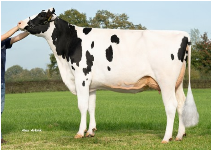
Koepon Crisalis Range 91 GP-84