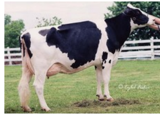
Mayerlane-DK Hiawatha EX-90