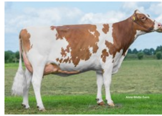
K&L GT Aderyn Red GP-84