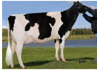
Belfast Bolton Supra VG-85