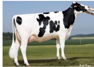
Sandy-Valley IO Amethyst VG-87