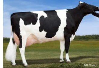
Sandy-Valley Bolt Sheila EX-92