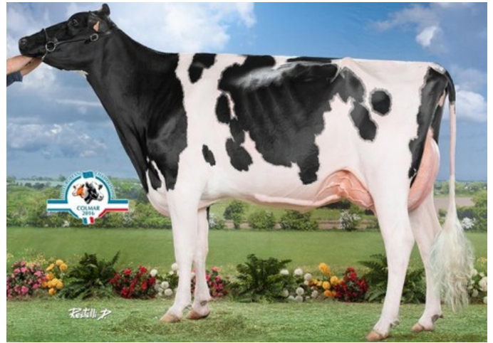
Hermine Tual, family of Maybelline VG-85

Pinball x Crimson x Granite x VG-85 Rubicon x GP-84 Cashcoin x VG-86 Man-O-Man x VG-86 Shottle x GP-84 Finley x Brett x Lantz